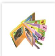
SINGLE PAGE DIE-CUT